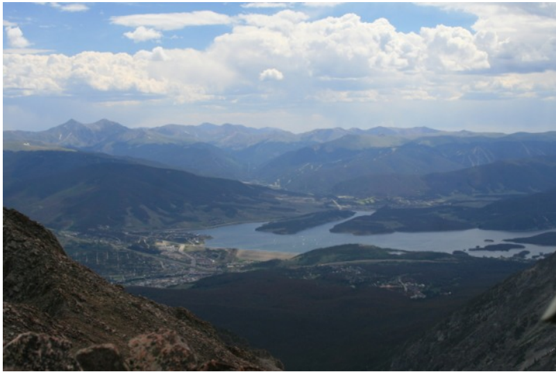
Mount of the Holy Cross: